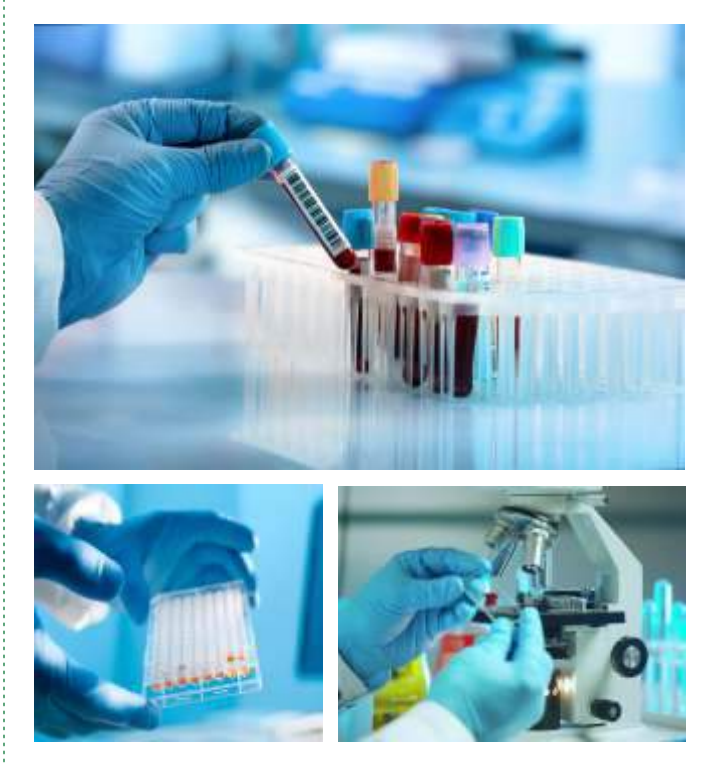
SATYAM SHIVAM SUNDARAM GROUP OF INSTITUTIONS